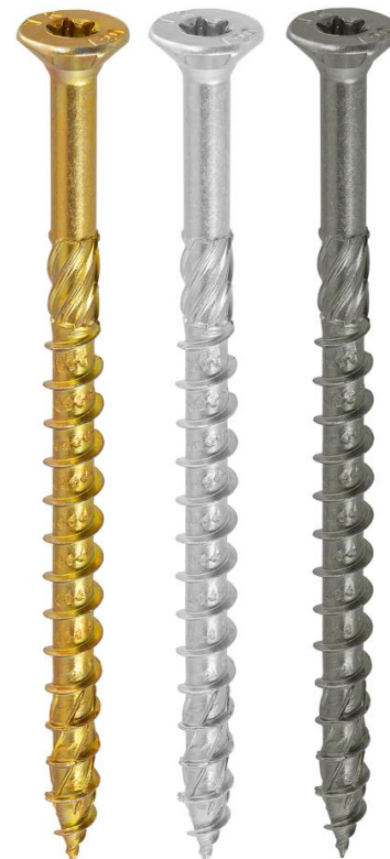
Zn - yellow Zn - blue* SQ ceramic* *item on request and to order

Screws conform to European standard: PN-EN 14592:2008+A1:2012